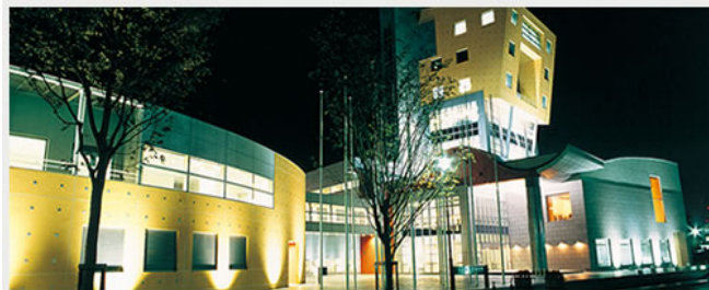
Kitakyushu International Conference Center

KJF 2010 will be held at Kitakyushu International Conference Center, Kitakyushu, Japan. Rihga Royal Hotel Kokura offers the best room rate for the KJF 2010 participants. You may also reserve other hotels in Kitakyushu. Please visit KJF 2010 web site and find more information.